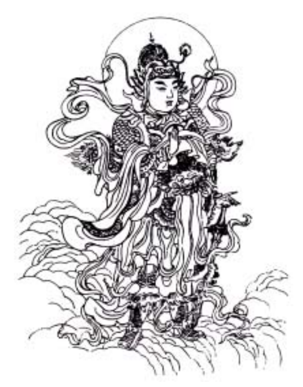
Dharma Protector Wei T'o Bodhisattva