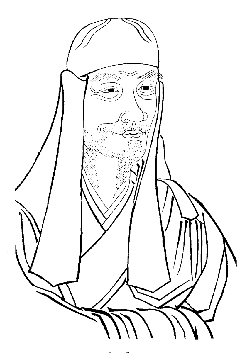
THE VENERABLE KUMĀRAJĪVA OF YAO CH'IN