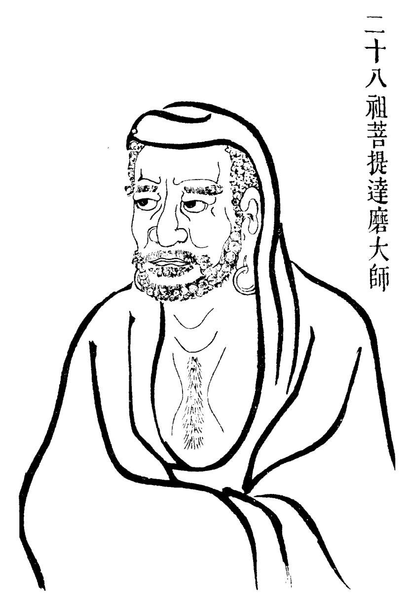
Twenty-eighth Patriarch Arya Bodhidharma The First Patriarch in China