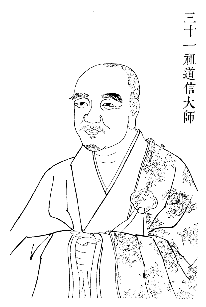
Thirty-first Patriarch Great Master Tao-hsin The Fourth Patriarch in China