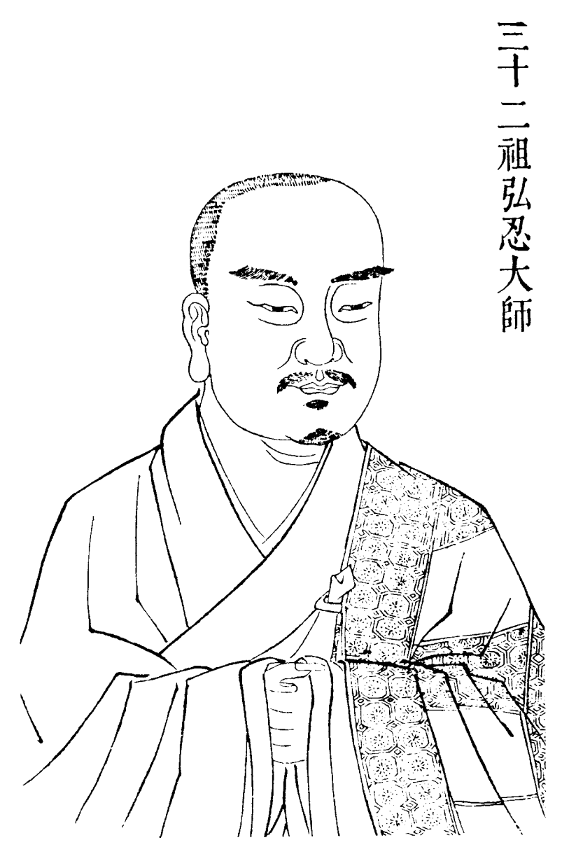
Thirty-second Patriarch Great Master Hung-jen The Fifth Patriarch in China