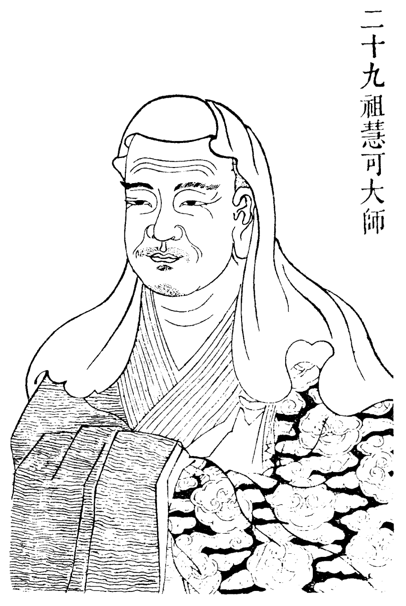
Twenty-ninth Patriarch Great Master Hui-k'o The Second Patriarch in China