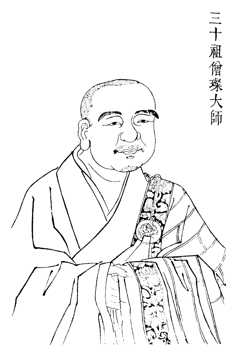
Thirtieth Patriarch Great Master Seng-ts'an The Third Patriarch in China