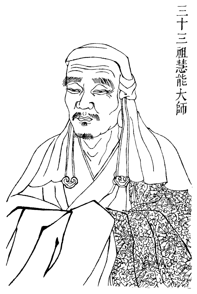
Thirty-third Patriarch Great Master Hui-neng The Sixth Patriarch in China